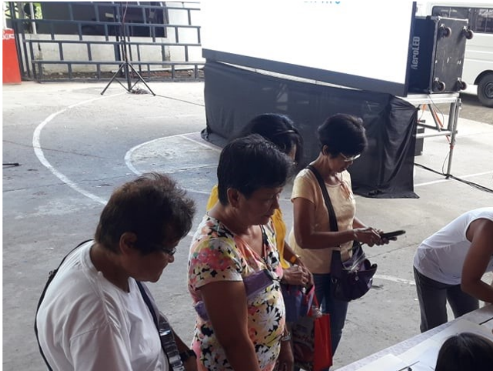
Plate 1: Registration

Photographs of the Public Hearing are shown below: