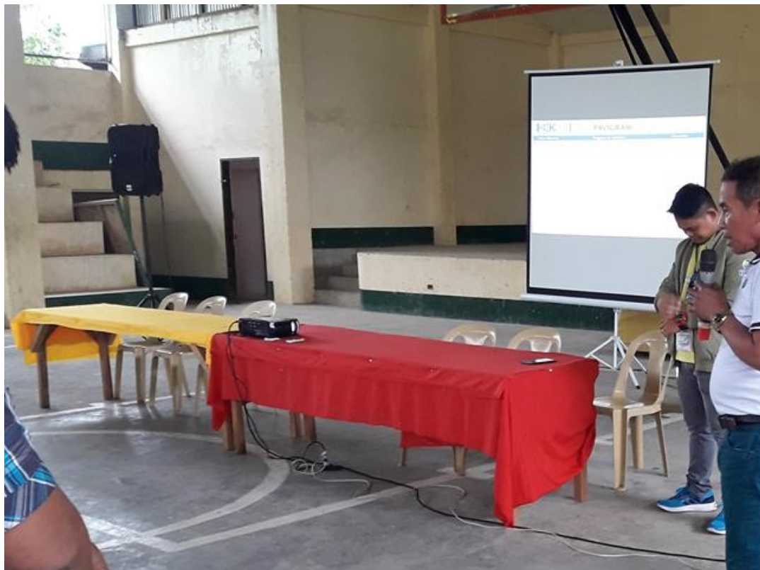
Plate 2: Opening Prayer