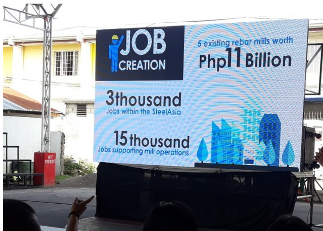
Plate 6: Mr. Roberto Cola from SAMC presents the project background, description, location, implementation schedule and other information or facts regarding the project