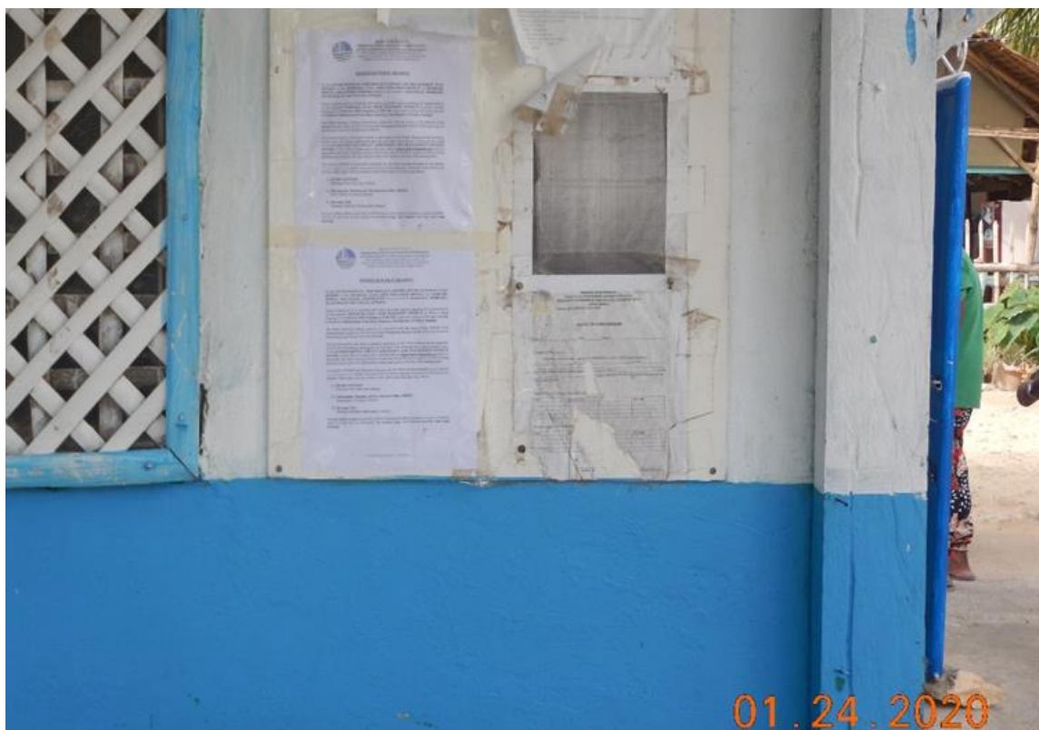
Figure 2. Notice of Public Hearing at Barangay Hall of Barangay Alegria, Caluya, Antique