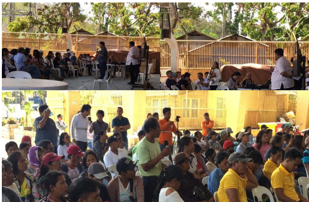
Plate 4. Open Forum