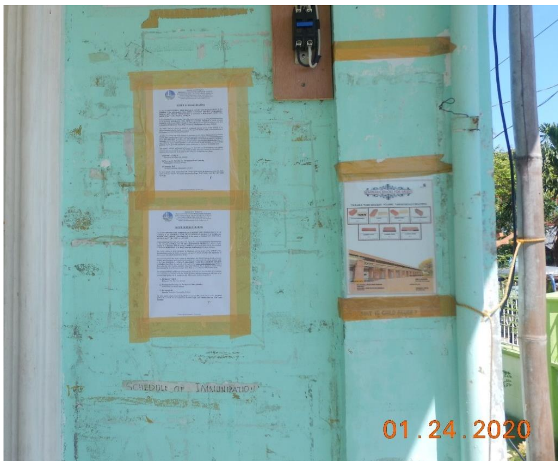
Figure 3. Notice of Public Hearing at Barangay Hall of Barangay Tinogboc, Caluya, Antique