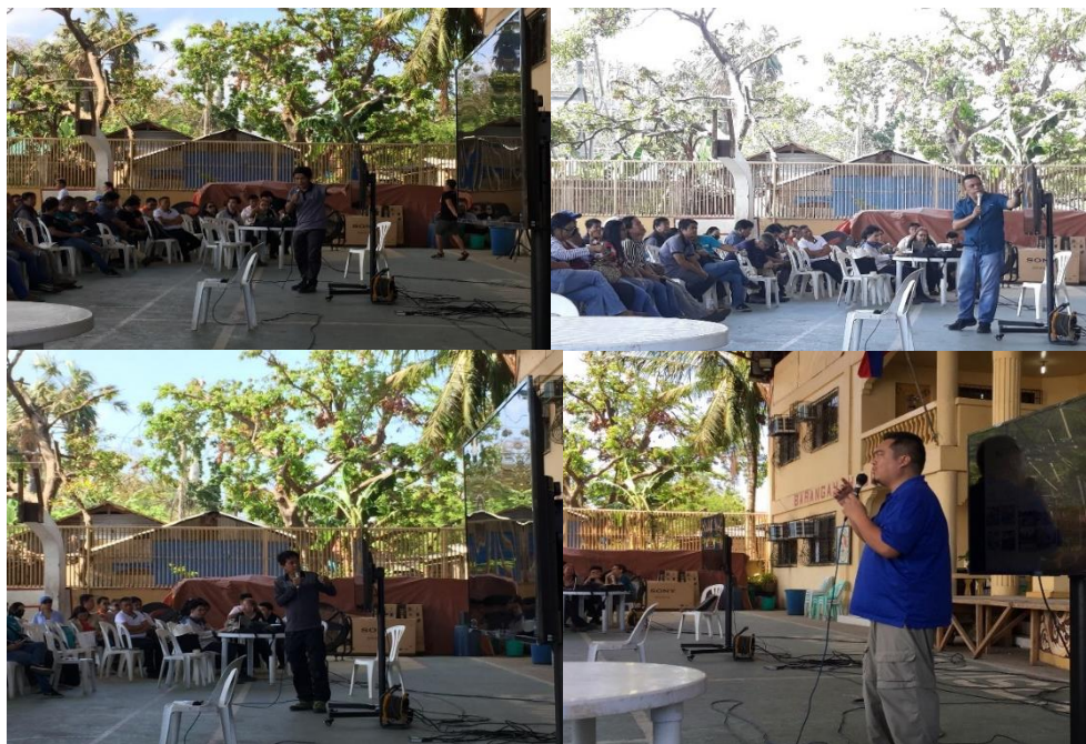
Plate 3. EIA Preparer's Discussion of Results of EIA on various Modules