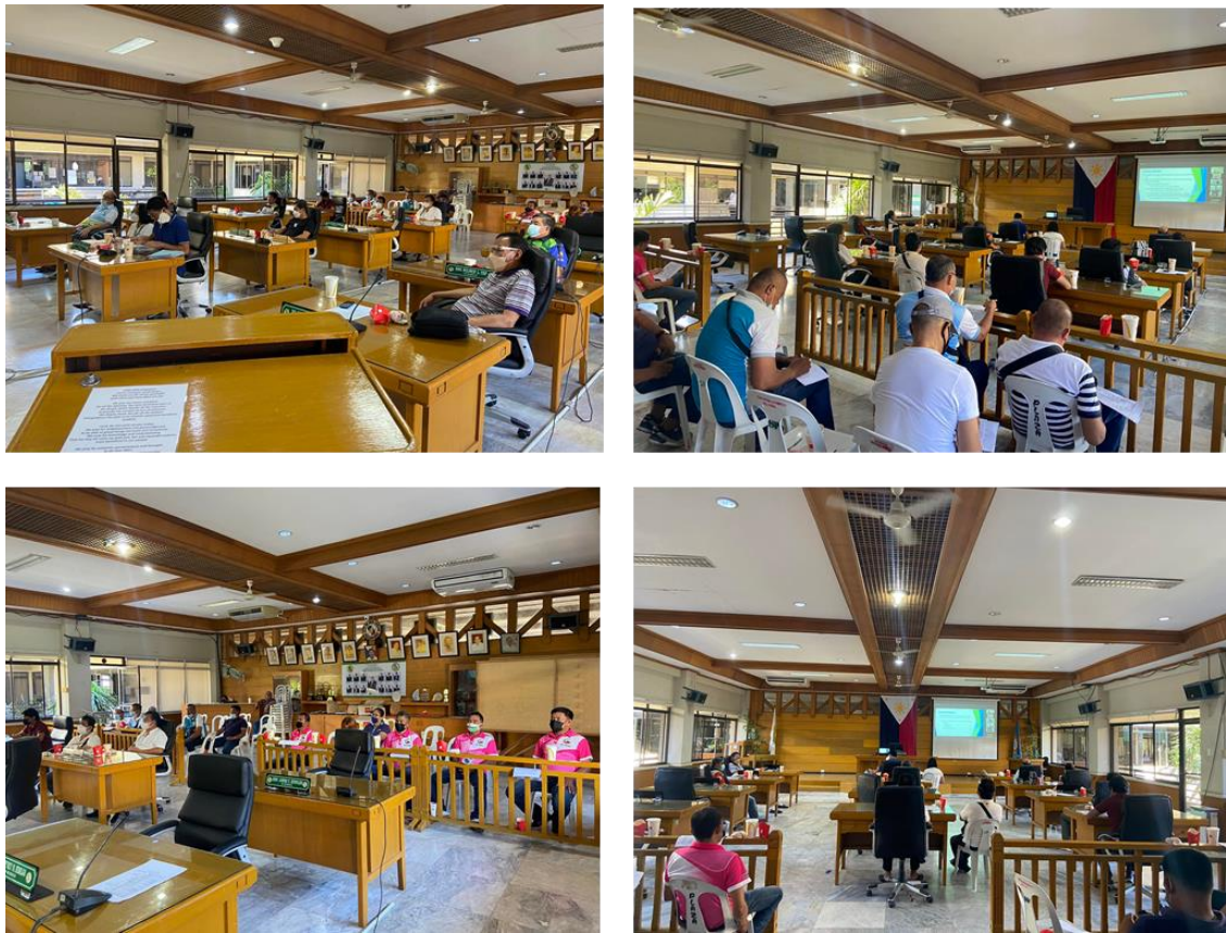
Figure 1: Photo Documentation of the Online IEC Meeting